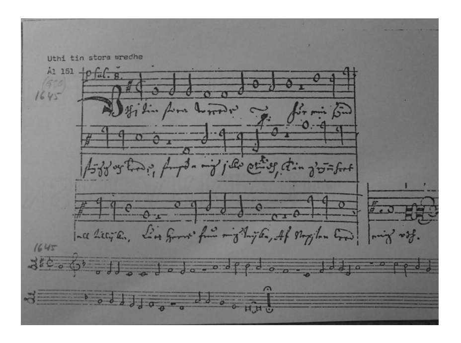
Fig. 1. Example entry from Svensk koralregistrant.

done centrally in Lund. The melody entries of this index are now approximately 30,000 in number. The sources covered are most numerous in the seventeenth and eighteenth centuries, with fewer entries from the sixteenth century and from the period 1800-1820 (this is the later limit for the project, due to the changes in hymnody and liturgy with Haeffner's semi-official chorale book from that year).